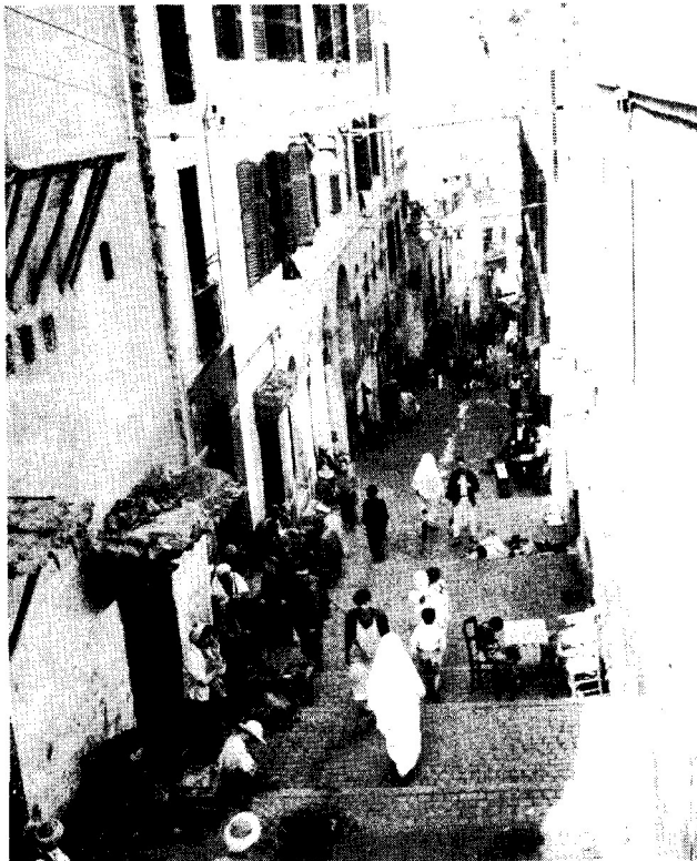
Left: A main street in typical middle-eastern cities. From such a street usually run torturous alleys and narrow pathways. Note the salesmen lining the street with their wares.