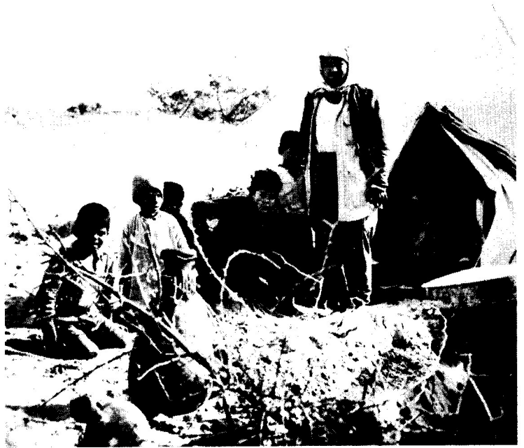
Above: Here you see the degenerate conditions under which many Arab refugees from Palestine must live. What a contrast to the mighty people who once inhabited this region!