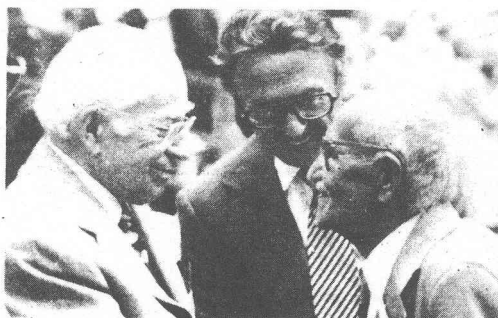
HAPPY GREETING — Pastor General Herbert W. Armstrong and newly ordained evangelist Stanley Rader meet a senior member of the Church during the Feast in Tucson, Ariz.

Local TV station cameras were there. One local TV news report that night said I started out