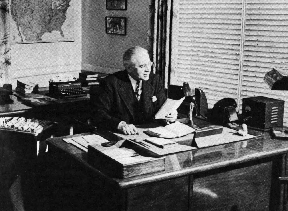
PHOTO SHOWS Herbert W. Armstrong making an early World Tomorrow radio broadcast. From the smallest beginnings, God's work has grown to international scope, carrying the true gospel to all the world as a final end-time witness.

That was Jesus' gospel. Notice the gospel which Jesus proclaimed.