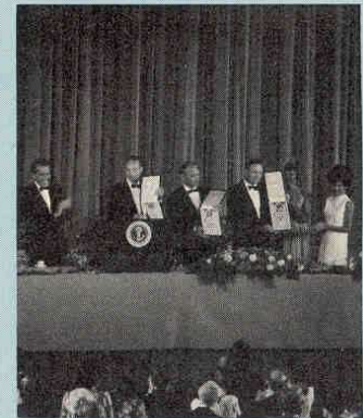
Clayton — Ambassador College