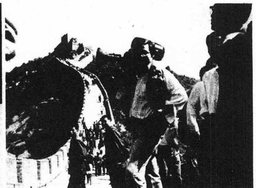
footage at the Great Wall of China, right. The material filmed will be used in documentaries relating to Herbert W. Armstrong's trip to the People's Republic of China.